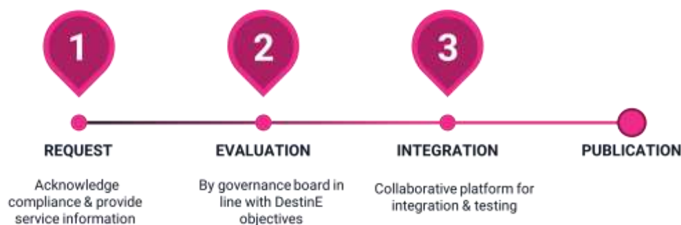
Figure 1: Stages of the Onboarding Process